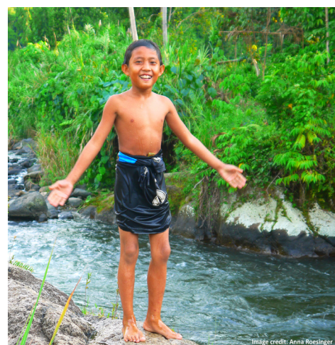
Local boy in Durian Rambun, Indonesia

Voluntary carbon markets, which Plan Vivo forms part of, have emerged as an option for companies to compensate for their unavoidable socio-environmental footprint, for example by reducing carbon emissions, by supporting biodiversity and water conservation or, in the case of insetting, by tackling procurement costs and risk, as well as by strengthening links with suppliers.