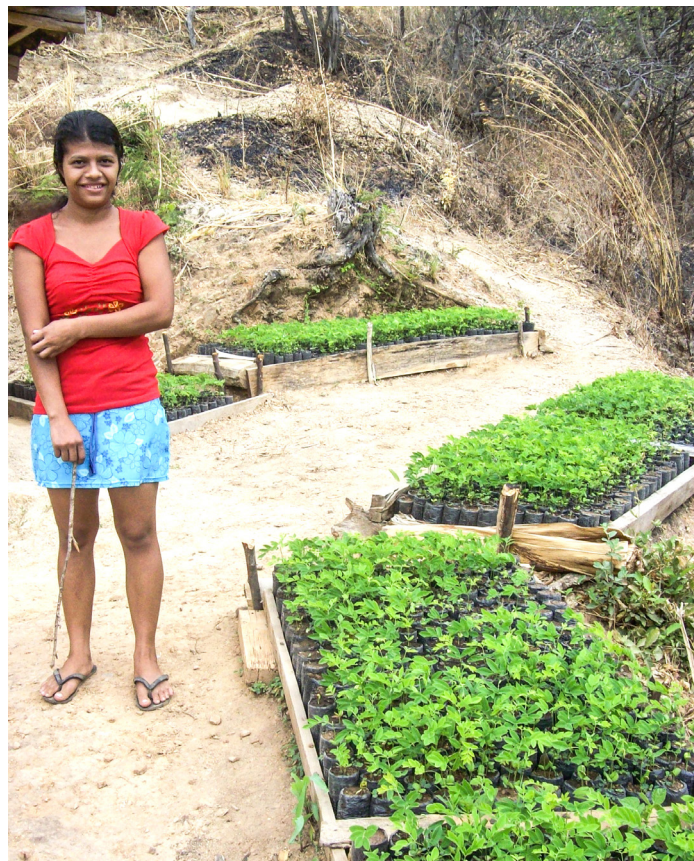
Nursery of CommuniTree project

The sustainable principles underpinning each management plan seek to find a balance between growing food, growing trees for sustainable fuelwood and timber and widening the area of impact on other ecosystem services. Improved management at farm level contributes to better water retention and less sediments. Planting greater numbers