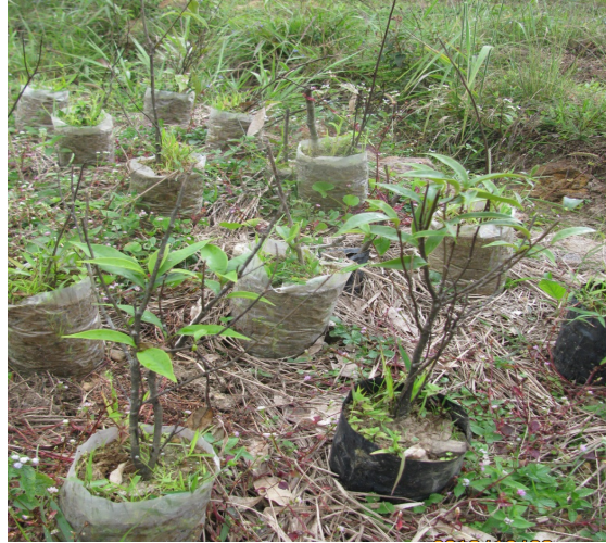
Tree saplings growing in poly pots.