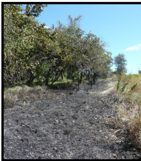
Burning of fire breaks